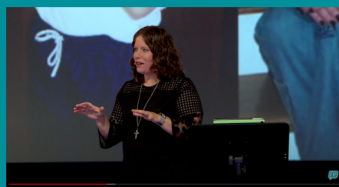
Why Gender Matters ReStory Ministries YouTube Playlists