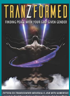
Tranzformed Documentary Pure Passion Media